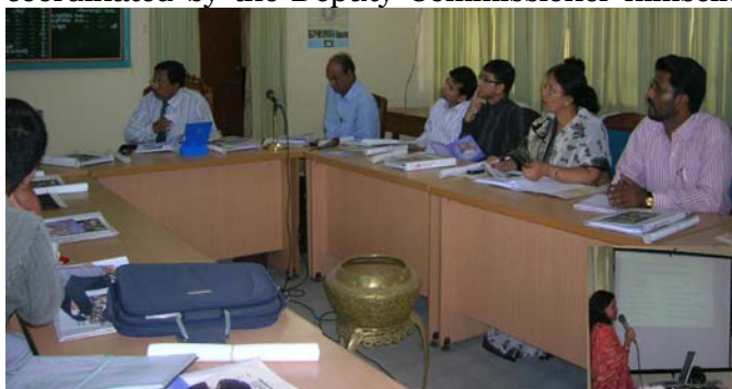
Photo: The meeting held on 23 June 2008. Deputy Commissioner, Asstt. Dty. Commissioner (general), UNOs from Jaldhaka and Saidpur and NGO representatives of Nilphamari were present.

LAMB Project had the opportunity to report on its programs and activities to the Nilphamari District NGO Coordination meeting organized and coordinated by the Deputy Commissioner himself.