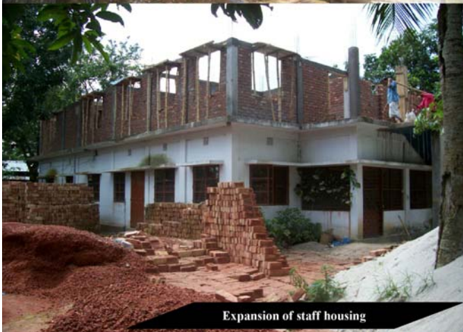
Expansion of staff housing