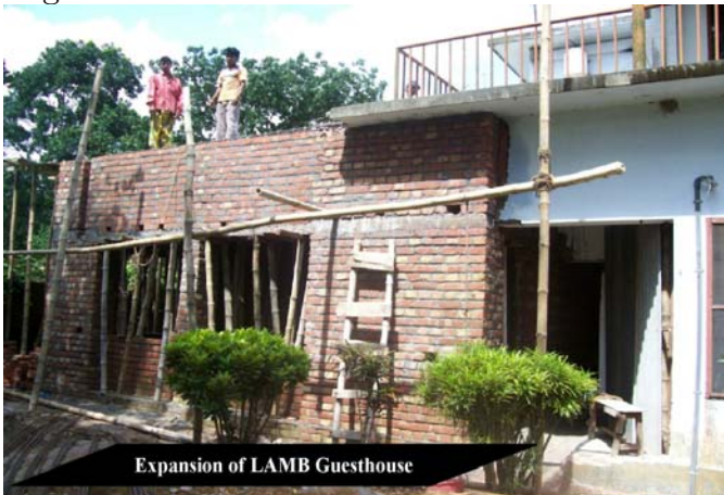
Expansion of LAMB Guesthouse

Currently there are three construction projects going on. The photos below show expansion of LAMB guesthouse (top), more housing on top of Gondhoraj (middle), and addition of office space on top of hospital building (bottom). Thank you to donors Operation Cleft, WMPL, Interserve and Engender Health